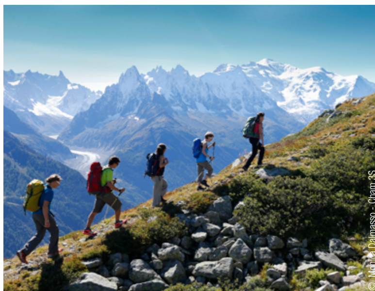
© Monica Dalmaso - Cham 3S

More info on https://maisondesguides-chamonix.com